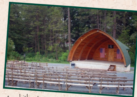
Our Amphitheater: local bands, karaoke and more...most every weekend

• BTW: The fall foliage is not to be missed. Indeed, we go all out for Fall at Twin Grove, the perfect time for building family memories!