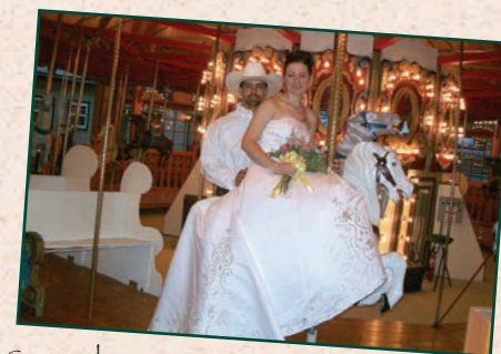
Our Carousel: great for special events...with a deco twist