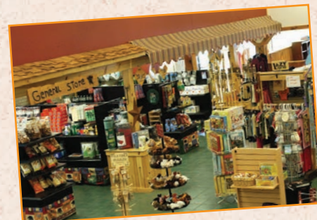
Our Store: unique gifts and camping / RV essentials...neat stuff