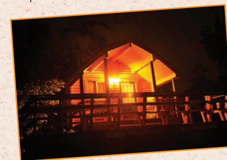
Our Cottages: warm and cozy...open all year